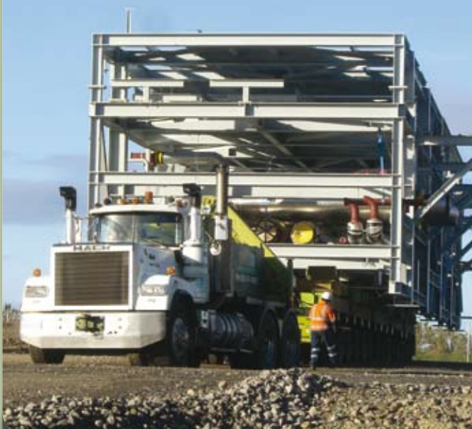
Delivery of a pipe rack to the Kupe Production Station

Further details of the status of the Pike project can be obtained at www.pike.co.nz