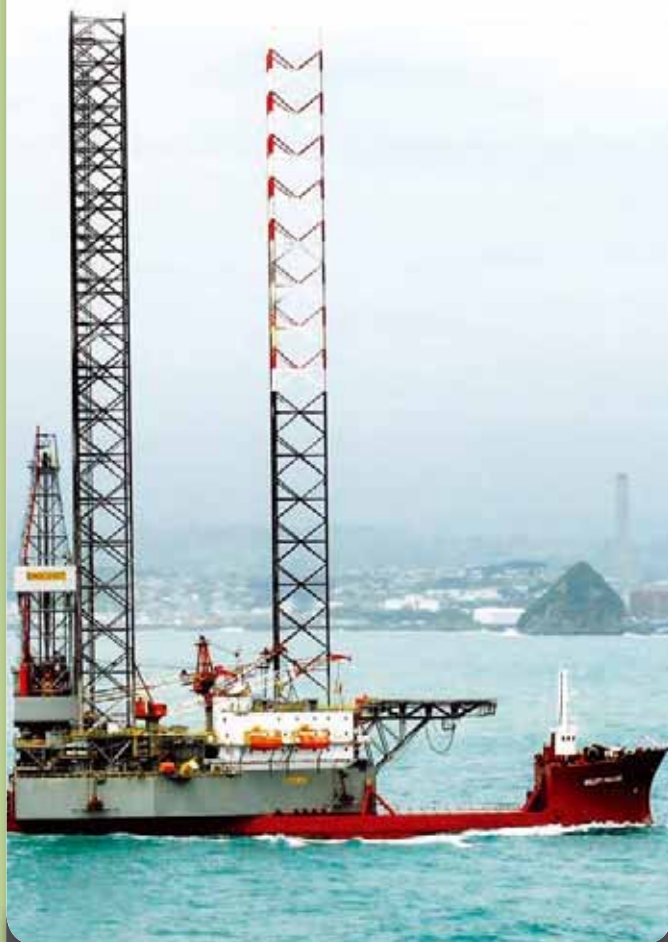
Kupe | Drilling rig arrives