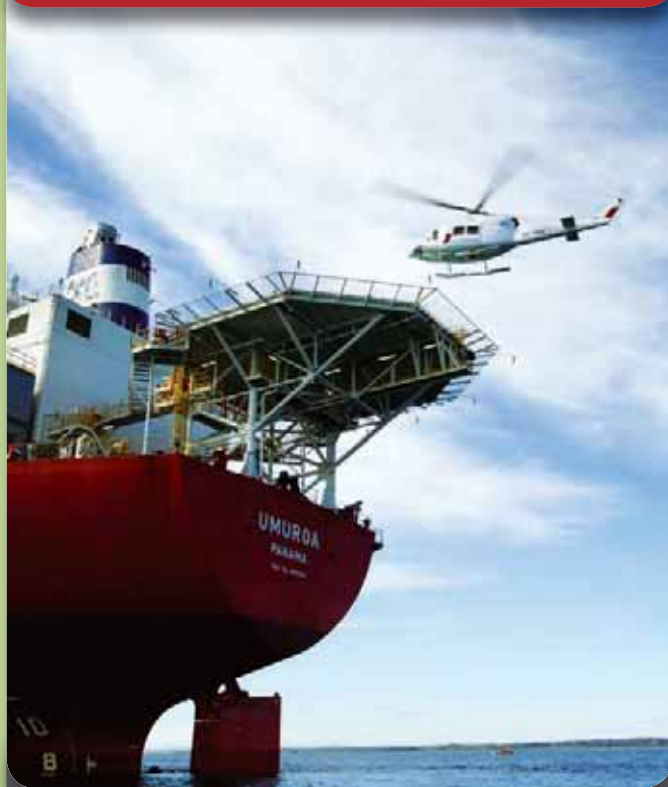
Tui | Umuroa FPSO